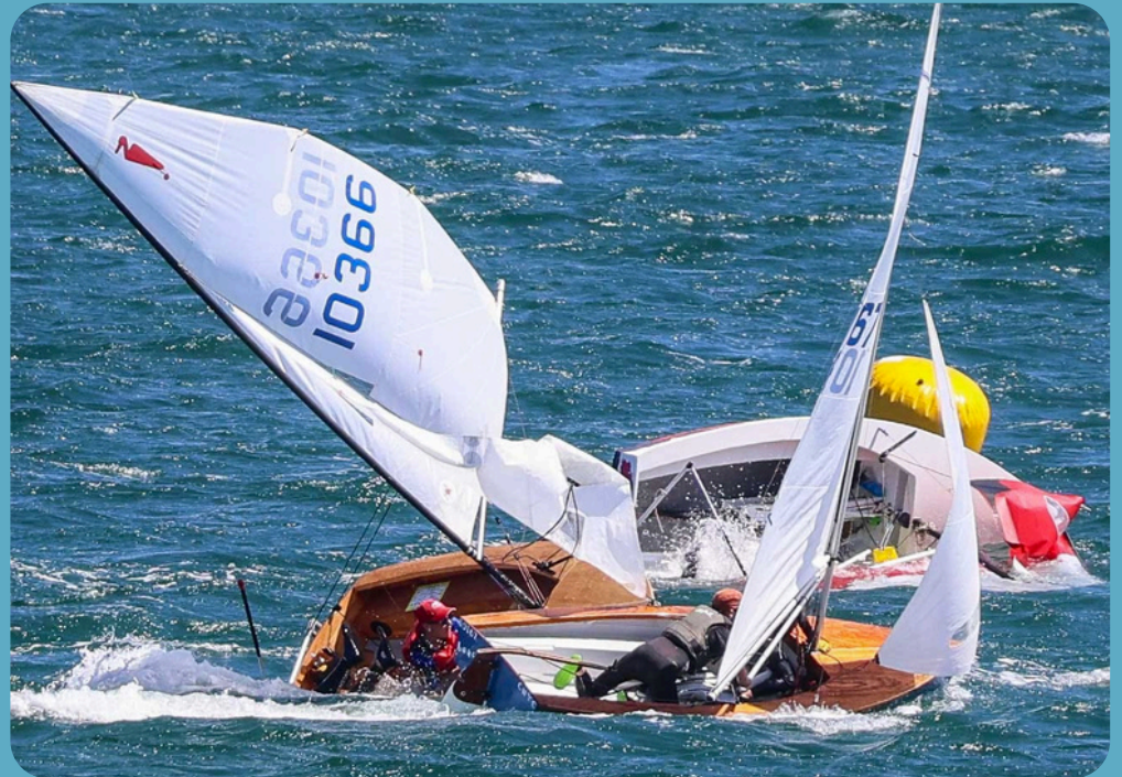
Stacks on the mill action in Heat 8 at the wing mark