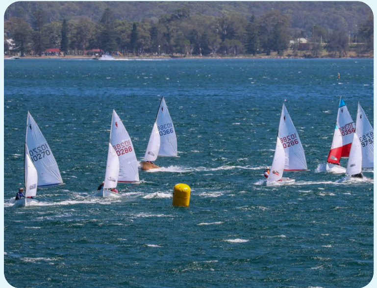
Racing at the Nationals Wangi Wangi Lake Macquarie