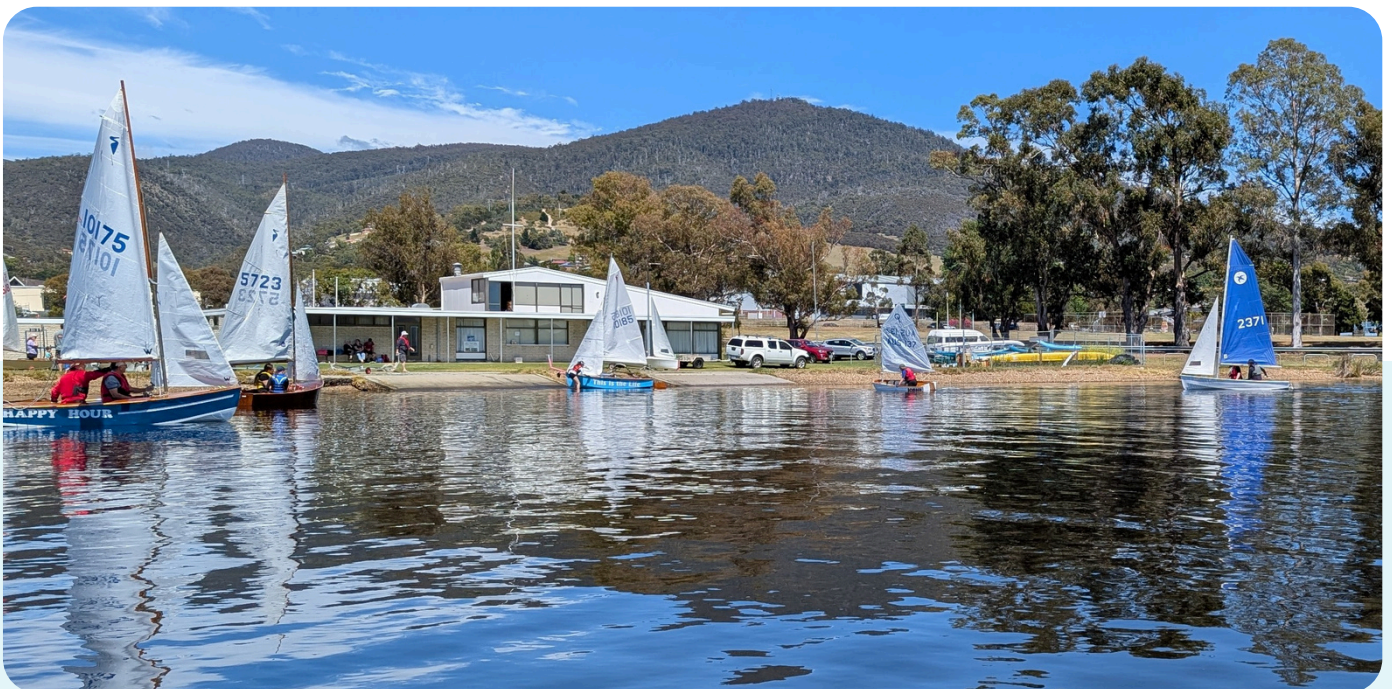
Montrose Bay training fleet 21 December 2025